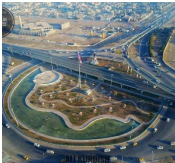
Figure (1-5) Monument of the Martyr Faily in Mutanabbi Square[8]

music associated with it surrounded the square with a new iron fence according to a design designed for this purpose. The development of Al Mutanabbi Square is part of the development of Mohammed Al Qasim Street leading to it. The fountain was completed and opened in the square in 2014. The fountain contains a water screen with dimensions (6 * 12) m and (10) high-quality lamps and reaches the water up to a height of 16 meters in different movements, as shown in Figure (1-4).