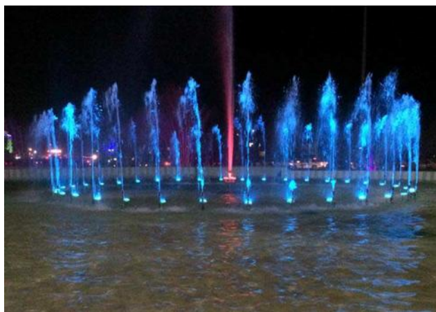
figure (1-7) Night dancing fountain, another design of fountain water flow[8]