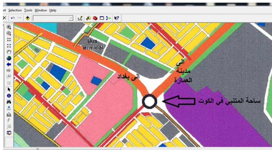
Figure (1-1) the location of the Mutanabbi Square in relation to the master plan of Kut City

Reference: Researcher based on GIS program