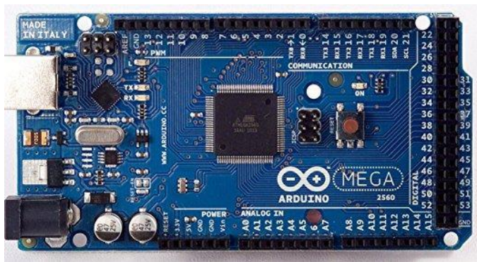
Figure 3.1 Arduino Mega Microcontroller

An Arduino Mega board will be a battery-powered board through the cable association or through an external power supply that'll provide.