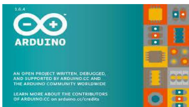
Figure 3.2.1.1 Arduino IDE Software

It will accustom for writing and uploading the programs to an Arduino board. The program of this system will be done by providing Arduino IDE software using a programming language C.