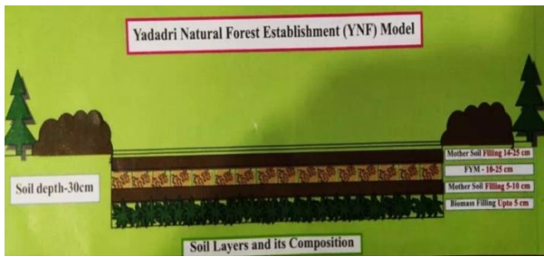
Figure 3 Soil layer and its Composition