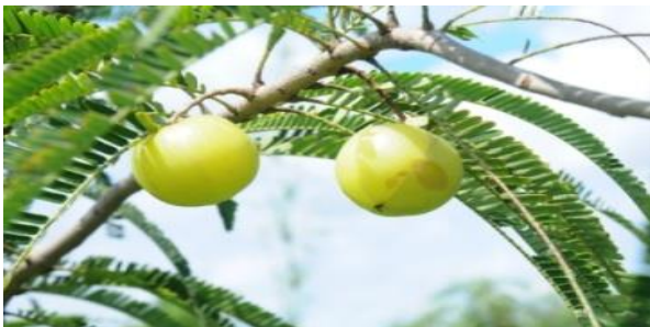
Figure 5 Fruiting at Yadadri Forest using Miyawaki method