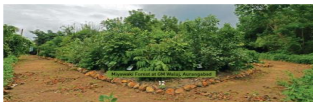
Figure 7Miyawaki Forest at GM Waluj, Aurangabad