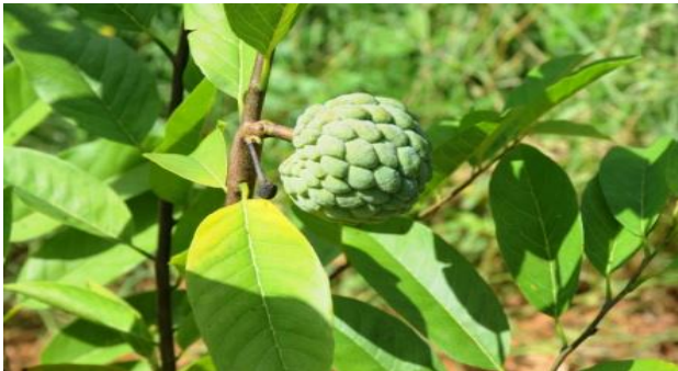
Figure 4 Fruiting at Yadadri Forest using Miyawaki method