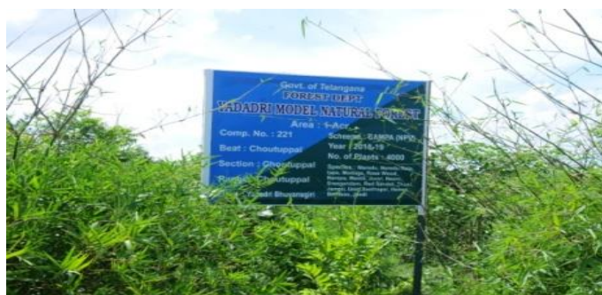
Figure 2 Yadadri Model Natural Forest using Miyawaki method

dense multi-layered forest was developed cost-effectively. Today, the plot houses 4,000 plants. Named as Yadadri Natural Model Forest (YNF), this forest consists of plants such as Maddi, Maredu, Seethaphal, Red Sandal, NereduRela, Rose Wood, Bamboo, Neem, Narepa, Jeedi, Ippa, and more. A high density plantation was developed using Miyawaki technique in small areas of land using diverse local species of plants. The project cost was around 2 lakh per acre.