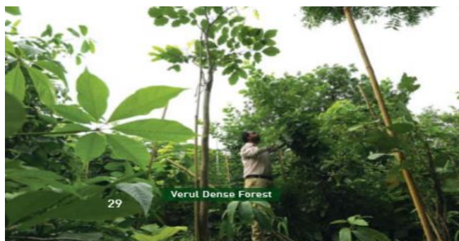
Figure 8. Miyawaki Forest at Verul Dense Forest, Aurangabad