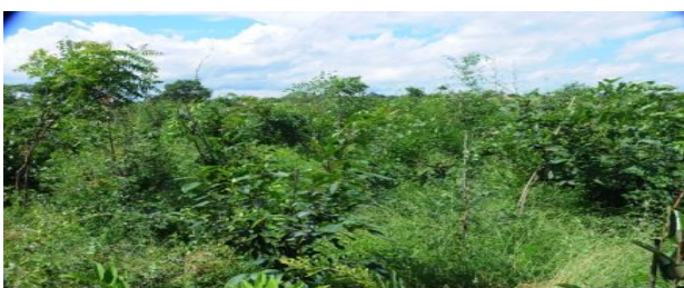
Figure 6 Yadadri Forest green cover growth using Miyawaki method