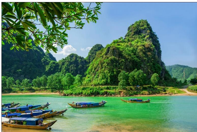
Figure 2. Phong Nha cave of Vietnam

Despite being a small area, Vietnam is a multi-ethnic country in which 54 ethnic groups live together. Each of the 54 ethnic groups has its own culture, its own food and drink, and its own language. In addition, because it was influenced by various countries such as China and France, multi-cultural and multi-ethnic have become a feature of Vietnam [6].