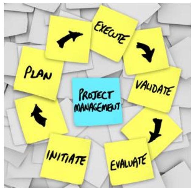
Fig.3: Role of Project Management

Construction, petrochemical, architecture, data era and lots of diverse industries that produce products and services use this activity title. The project manager have to have a mixture of skills which includes a capability to invite penetrating questions, detect unstated assumptions and remedy conflicts, also as more widespread control capabilities. Key amongst a venture supervisor's duties is that the recognition that hazard without delay affects the likelihood of achievement which this danger ought to be both officially and informally measured during the lifetime of a challenge. Dangers stand up from uncertainty, and consequently the successful challenge supervisor is that the only who specializes in this as their number one problem. Maximum of the issues that effect a mission end result in a method or another from chance.