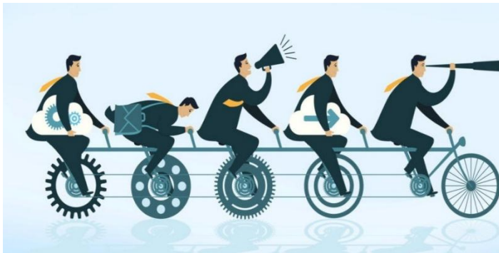
Fig.1: Project Manager

Task manager duties a mission supervisor, with the assistance of their group, is charged with a couple of duties that span the 5 mission levels of a challenge life cycle (initiating, making plans, executing, tracking and closing) under. The undertaking control stages intersect with 10 expertise areas.