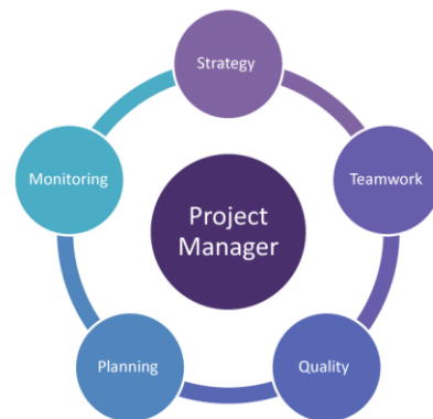
Fig.2: Project Manager Performance

Conflicts, also as more preferred management capabilities. As aforementioned, it is been diagnosed that a venture of an assignment manager is extremely essential to ensure the fulfillment of any design or production mission.