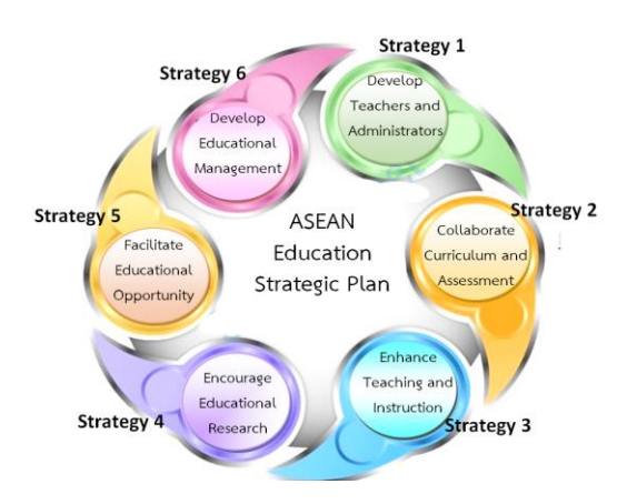
Figure 1. ASEAN Education Strategic Plan Source: Phra Rajvaramethi and L. Klomkul, 2017

For the strategy of educational management for peace in ASEAN community, it indicated that six strategic aspects were synthesized consisted of strategy 1 develop teachers and administrators, strategy 2 collaborate curriculum and assessment, Strategy 3 enhance teaching and instruction, strategy 4 encourage educational research, strategy 5 facilitate educational opportunity, and strategy 6 develop educational management and showed as below figure.