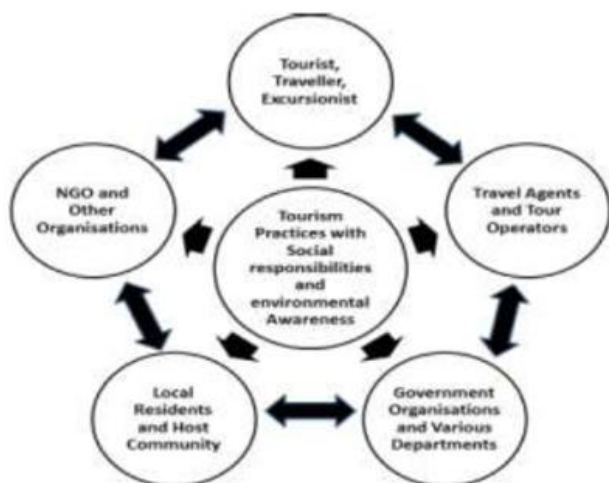
Chart 2: Tourism Stakeholders