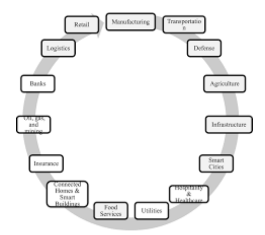
Fig. 2. The beneficiaries of IoT applications (Source: Evtodieva, T. E., Chernova, D. V., Ivanova, N. V., & Wirth, J. (2019)

A. Meola mentioned different areas that benefit mainly from the IoT (Fig. 2).