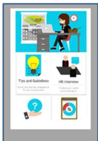
Figure 1. The developed Smartbot Application

This e-learning platform is optimized by Artificial Neural Network (ANN), which is responsible for analyzing, selecting, and tagging of input contents in the HR Interview and behavioral traits examination.