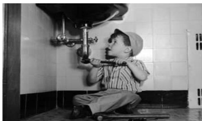
Fig no 5: Practical Education

Practical education means that gain information with sensible expertise. sensible education is healthier as a result of then you truly knowledge to try and do things within the world. the simplest