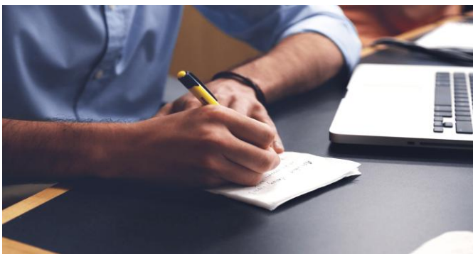
Fig 4: Theoretical Education