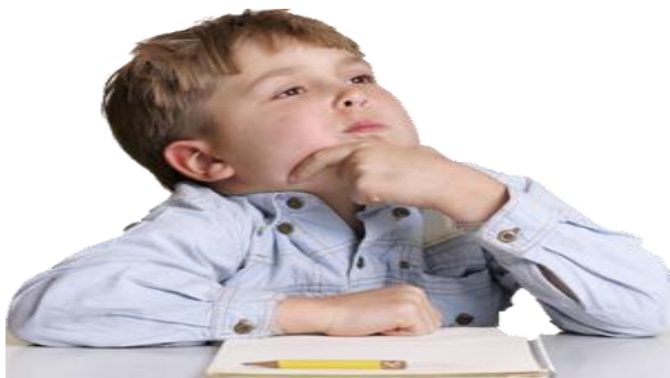
Fig 3: Theoretical Education