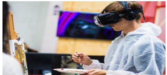
Fig no 7: Practical Education

Rote gaining knowledge of way that reading and memorizing. For the longest time, the Indian training gadget has depended on this technique to show college students. However committal to reminiscence doesn't do any favors for the scholar or for their destiny. This mastering method doesn't venture teachers either, as a result of all they need to try and do is educate, create them memorise, then merely check them. Teachers and college students every have the benefit of hard education strategies that involve theory and have a look at every.