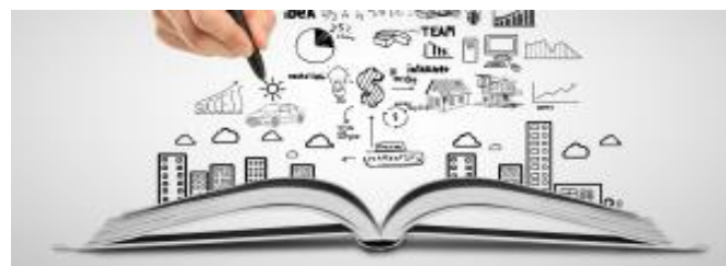
Fig 2. Theoretical Education

. Theoretical education is healthier as a result of then you'd be able to work out a way to do new things or handle any scenario. Theoretical data