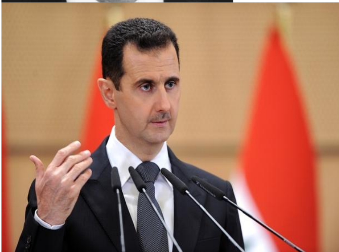
Hafez al- Assad