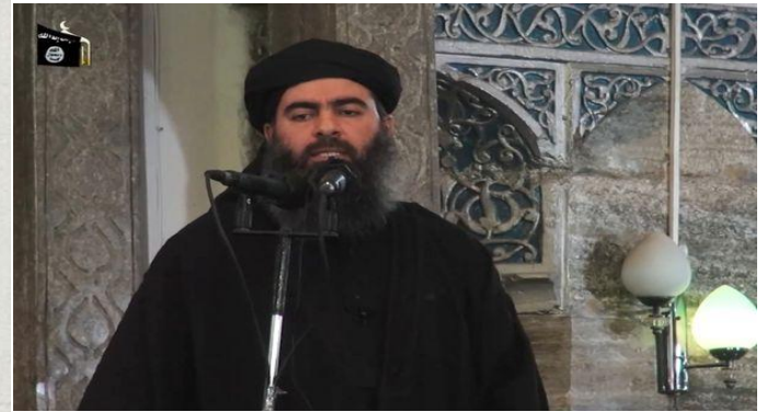
'Abu Bakr al Baghdadi'.

6) Origin of Islamic State of Iraq and Syria : - This is the most recent cause of this civil war where a large swath of area in Iraq and Syria has been captured by a global terrorist organization ISIS also known as 'Daesh' in Arabic language. The Syrian government, the rebels, Kurds and their all western allies are fighting here against this evil force to liberate areas under ISIS control. The organization is headed by self declared Caliph 'Abu Bakr al Baghdadi'.