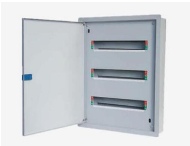
Figure 3. Electrical equipment tool.

There are two reasons for the failure of mechanical and electrical equipment components to burn out: (1) Human causes. The use of mechanical and electrical equipment is not standardized and the actual operating load is higher than the rated load for a long time, causing the internal circuit current to exceed the maximum allowable value of the component and burn out. In addition, mechanical and electrical equipment is exposed to a high temperature environment for a long time, which causes the insulation of internal components to decrease and burn out due to local short circuits. (2) Natural causes. In the operation of mechanical and electrical equipment, the protective measures are not in place, such as not paying attention to rain protection, lightning protection, etc., resulting in rainwater or lightning strikes, short circuits or excessive internal currents and burns [4] . The electrical equipment tool is in the figure below.