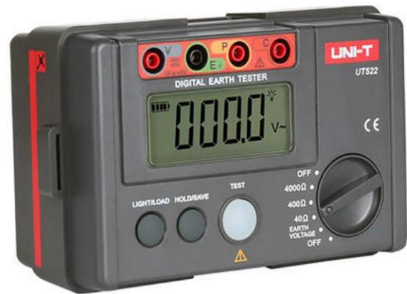
Figure 1. Electrical equipment system.

Switches are the most commonly used parts of mechanical and electrical equipment. They are used to control the start and stop of mechanical and electrical equipment. They are frequently used daily. Once their service life is exceeded, the switch shrapnel is prone to failure and jamming. At the same time, long-term use will cause a phase to loosen, poor contact and even contact burning phenomenon, which may cause tripping or fire. In addition, some technical personnel do not operate properly, press the switch too hard, or do not pay attention to daily maintenance, which causes frequent switch failures and affects the normal use of mechanical equipment [2] . The electrical equipment system is in the figure below.