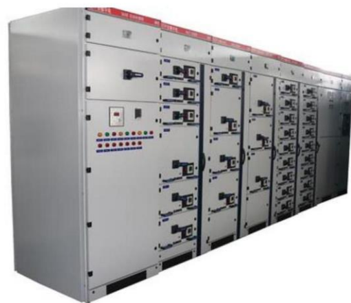
Figure 4. Electrical equipment thermal system.

will cause the temperature of the device joint to continue to rise, which will cause serious thermal failure problems and also buried safety risks. According to related investigations and studies, the probability of electrical equipment thermal failures caused by poor external contact accounts for 90%, so the prevention and control of such failures is very critical. Under normal circumstances, according to the external fault temperature, the external thermal faults of electrical equipment can be divided into the following three levels, namely general level, severe level and critical level. In practice, fault handling needs to be performed according to the level [5] . The electrical equipment thermal system is in the figure below.