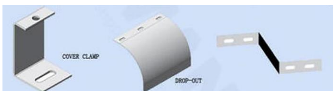
Figure 5. Electrical equipment connect system.

Facilities and components are the main parts of electrical equipment and their main functions are to transmit, receive, solve, transform, implement and output electrical energy or electrical signals. Electrical problems mainly occur in facilities and components, so electrical problems in testing facilities and components are the most important content. The types of electrical facilities and components in electrical equipment are complex, such as motors, controllers, contactors, relays, automation control systems, etc. and their structures, functions and performance are all different, so it is difficult for the staff To detect the hidden dangers through a certain method, the following is a classification analysis. The DCS system interference fault is eliminated. The electrical control facilities of electrical equipment are not from the same supplier, which is complicated and has a large workload, so it is difficult for the control facilities to connect with the DCS system; most electrical equipment has more electrical control facilities, especially The use of frequency converters will cause serious magnetic field disturbance, which will cause confusion in the instrument and DCS system. To prevent this from happening, electrical equipment must be isolated and shielded to prevent magnetic field induction and charging [6] . The electrical equipment connect system is in the figure below.