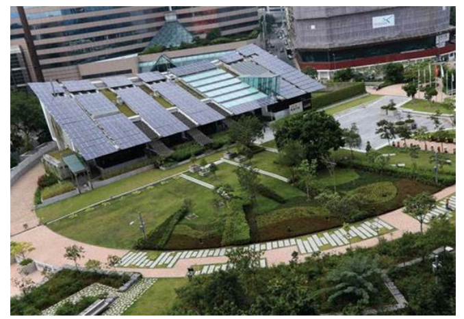
Figure 3. Environmental diagram of an energy-saving prefabricated building in prefabricated design.

As shown in figure 3 above, the green parts are all prefabricated buildings of residential houses. The designers conduct theoretical analysis on the energy conservation of prefabricated buildings, so as to develop the red area on the left that is suitable for China's actual conditions.At the same time, prefabricated building designers should focus on the use of energy saving materials, vigorously develop and study energy saving equipment in prefabricated building, especially the research on the combination of prefabricated building technology and high and new technology.In addition, prefab building designers should promote and popularize advanced energy-saving technologies.