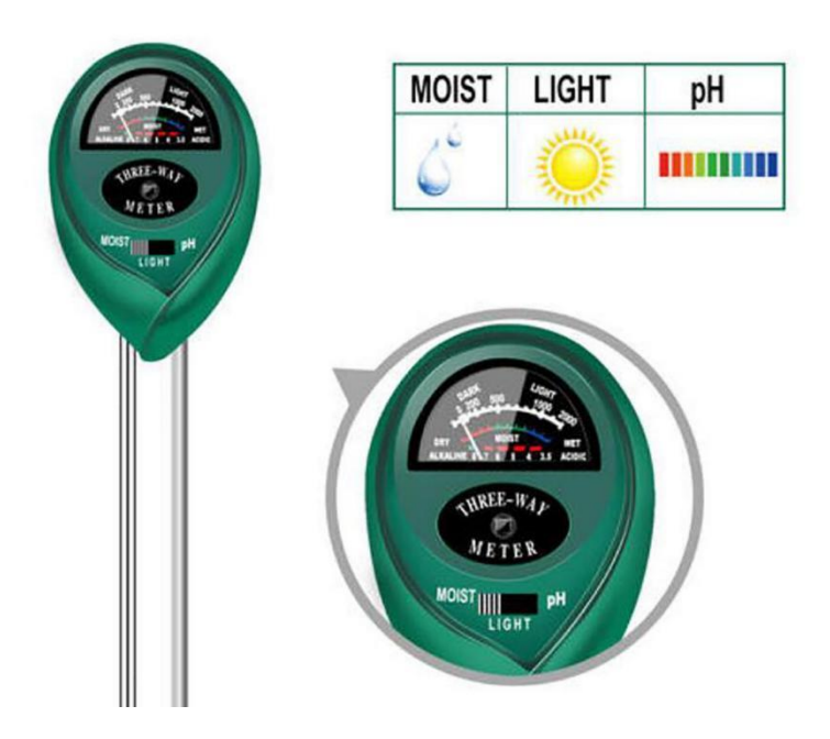
Figure5 Concrete hydration factor.