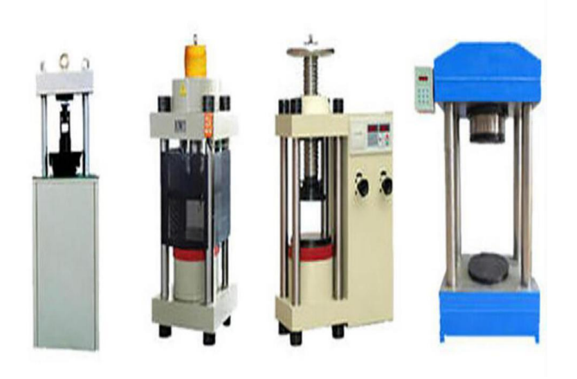
Figure 1. Concrete monitor system.

message text and the separator of the instant message. , Carry out sufficient instant message text extraction and then perform character matching on the repeated parts, so as to quickly judge and deal with the abnormal information of the monitoring information and reduce the inaccuracy of various information processing. Compared with traditional digital data matching method, the data matching method of the instant communication monitoring technology has outstanding advantages in use, which can solve the large memory occupation of system resources to the greatest extent, so that the information processing efficiency of the instant communication monitoring technology can be significantly enhanced<sup>[2]</sup>. The concrete monitor system is in the figure below.