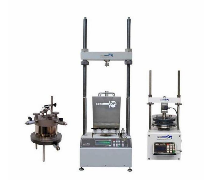
Figure4. Concrete factor.

If the mixing ratio is improper or water is added arbitrarily on site, the free water in the concrete will not only meet the needs of the hydration reaction, but the remaining free water will evaporate directly on the surface and the free water inside will also pass through the capillary pores for a long period of time. It will evaporate and leave tiny cavities<sup>[5]</sup>. For example, during the hardening of concrete, the surface slurry tension is greater than its strength, the surface tension will pull these cavities through, forming irregular tortoise cracks on the concrete surface. In engineering practice, after the concrete is poured, if there is a layer of floating slurry on the surface of the structure that is not removed in time, network cracks will occur after the floating slurry is solidified because of the above reasons. The concrete factor is in the figure below.