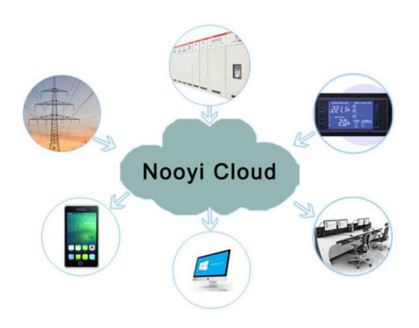
Figure 3. Power control system.

In order to make the cloud computing virtual model maintain high stability in computer data processing, is necessary to first query the characteristics of the client component in the frame design and use the method of critical path index to judge the effectiveness of data processing. At the same time, in order to reduce the utilization of local resources as much as possible, distributed data stream parallel computing can be used. In this computing method, the data stream needs to establish a channel with the help of TCP during the execution of the data stream and then obtain the cloud, wireless network and client Within the model. Through the cloud computing virtual model, in addition to analyzing and reconstructing computer data, it can also integrate and dynamically allocate data, which can improve data computing capabilities and meet the needs of users<sup>[4]</sup>. The power control system is in the figure below.