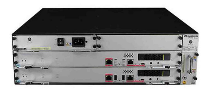
Figure 1. Power supply system.

In the process of using cloud computing technology to process computer data, it is necessary to construct a relatively complete cloud computing model first. When constructing the model in detail, advanced virtualization technology can be used to provide users with personalized services. In the computer network, cloud computing mainly uses network robots to sample data and extract question semantics from it. Based on this, the establishment of a virtual model for multi-source data processing is completed. Using technologies such as virtual resource architecture and data mining, application resources are searched from the Internet and after analysis and processing, they are dynamically allocated, which can significantly increase the data processing speed. Since the construction of a model is the key to realizing cloud computing to process data, it is necessary to ensure that the model constructed is stable and reliable. Based on this premise, the computer data in the virtual database can be used as samples when the model is constructed and the construction of the data time series model can be completed by relying on the ontology semantic technology<sup>[2]</sup>. The power supply system is in the figure below.