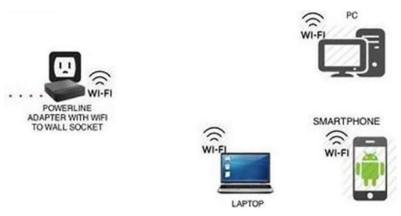
Figure 5. Power wireless system.

attention to their own attitudes and constantly improve customers' goodwill and trust in power supply companies<sup>[5]</sup>. The power wireless system is in the figure below.