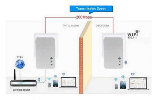
Figure 6. Power router system.

In the process of exploring the optimized service mode of power marketing, power supply companies must also pay attention to the role of power marketing personnel, continuously improve the business level and professional capabilities of power marketing personnel and form an excellent power marketing team. Regular training can be conducted for electric power sales personnel to strengthen the marketing concept of high-quality services and truly implement the measures of high-quality services in power marketing into daily work. The power router system is in the figure below.