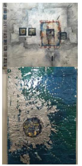
Figure 1: 2016 Asia Quilt & Knit Festival works. Shanghai.

In the creative design process of China clothing design materials, the commonly used methods are knitting, blending, embossing, sewing and hollow out.