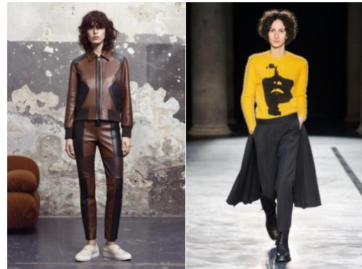
Figure 1: Neil Barrett Fall 2016 Ready-to-Wear Collection. Italy. Designer: Neil Barrett.

multiplying it on various pieces — a duffle coat, a sweatshirt, a bomber. "I tried real fur, but it looked too retro, and eco fur was so pantomime," Barrett said, "explore further fabric innovation. Every season I'm like: What's next?"