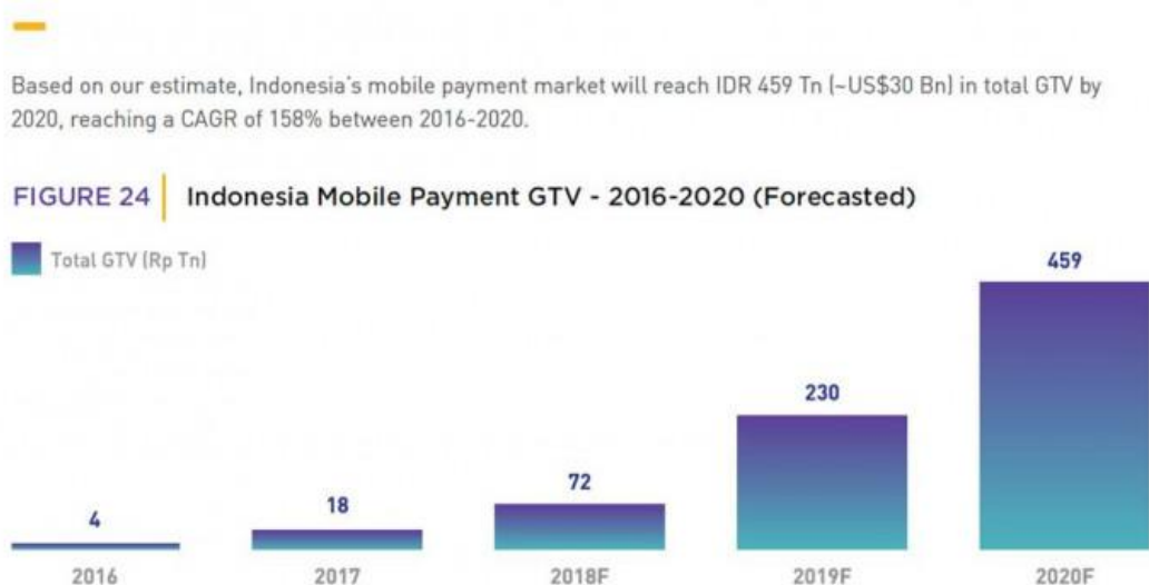
Figure1. Indonesia Mobile Payment Forecast 2020

How big is the mobile payment market in Indonesia? Referring to research conducted by MDI Ventures & Mandiri Sekuritas, the estimated mobile payment transaction volume will be US $ 16.4 billion in 2019. This figure is equivalent to 2% of Indonesia's gross domestic product (GDP) of US $ 888.6 billion. While this market potential will surge to US $ 30 billion or equivalent to Rp459 trillion in 2020 or one fifth of the world. (2018) examined the effect of financial literacy on student spending habits. The results of this study indicate that financial literacy has a negative effect on student spending habits indicate that (1) lifestyle has a positive effect on cashless society behavior but financial literacy has no effect on cashless society behavior. Gitaria (2018) examined the effect of financial literacy on student spending habits. The results of this study indicate that financial literacy has a negative effect on student spending habits