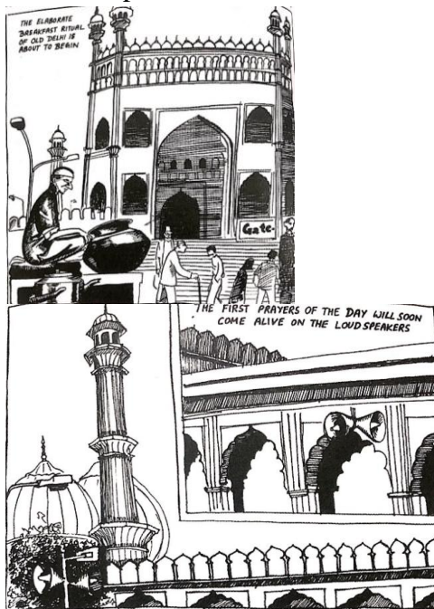
Figure 3. Page no.46 and 47 respectively

playing games like ‘chosar’ in the parts of North Daryaganj, images of public parks, small vendors earning their livelihood in front of masjid’s front gate, etc., Stones on one hand immortalizes the human existence and on the other, it also represents its vulnerability. Banerjee tries to illustrate the monumental past of India and attempts to evoke the nostalgic feeling among its Indian readership. Running parallel is the ‘New India’ and which is providing a contrast between the old and new India, evident of the changes that have come in the past few decades in India.