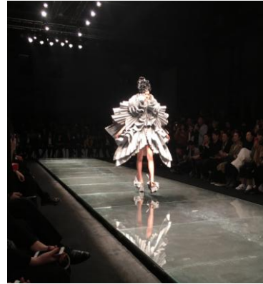
Fig 4: Z28 Fashion Silicon Valley

investment, art fund investment, industrial park management, Internet business incubation, and cultural enterprise investment. The successful transformation of this place sets a good example for the development of other similar projects (Fig 3).