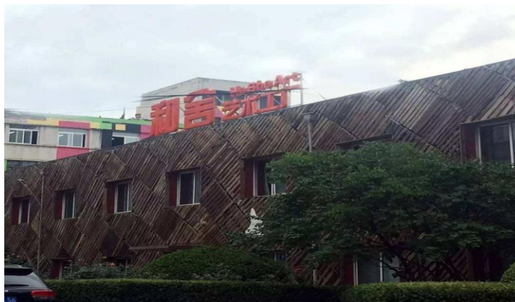
Fig 3: Dalian Heshe Art Zone

exhibition and technology innovation base (Fig 1). It gives new vitality to the local community, creates a great business atmosphere, builds new landscapes and provides better public facilities (Fig 2).