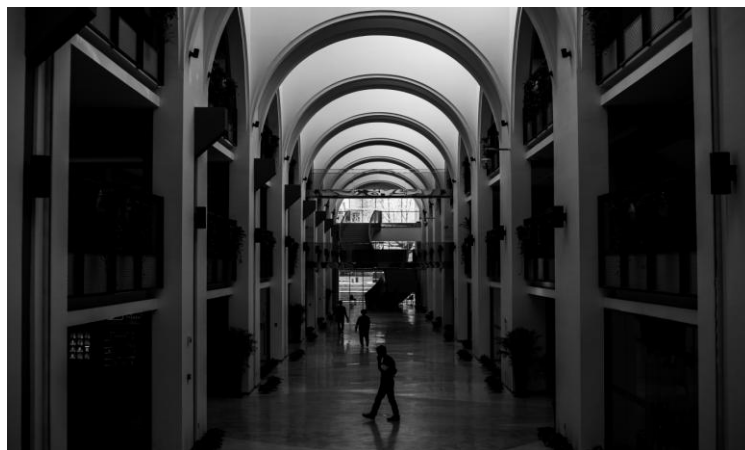
Fig 2: Dalian Wisdom Park after Regeneration

As a key urban regeneration project in Dalian, Dalian Wisdom Park aims to develop the former Dalian Refrigerator Plant (built in 1930) into a commercial complex, which mainly deals with finance, education, culture, entertainment,